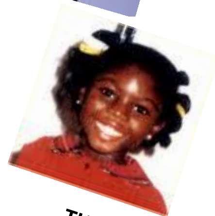
THE INQUIRY VICTORIA CLIMBIÉ Chairman: Lord Laming